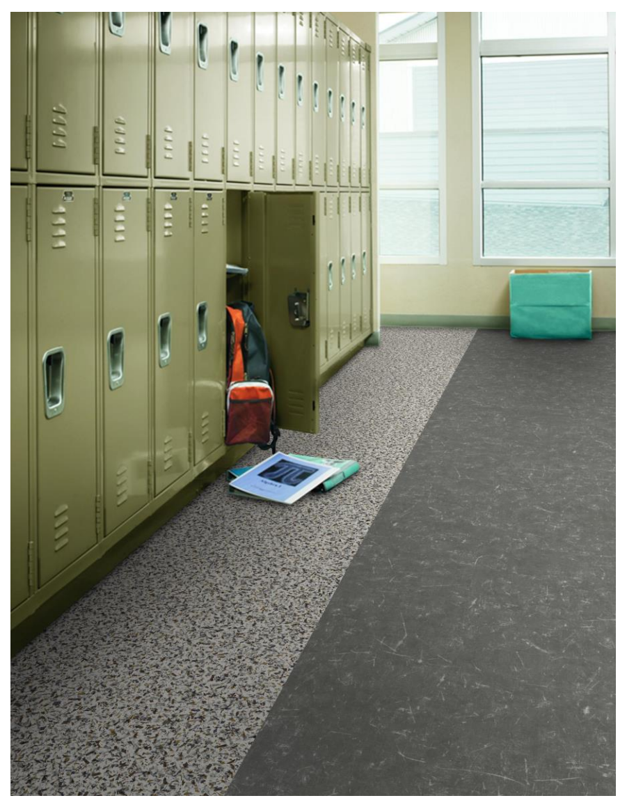
4.5 MM LVT Luxury Vinyl Tile