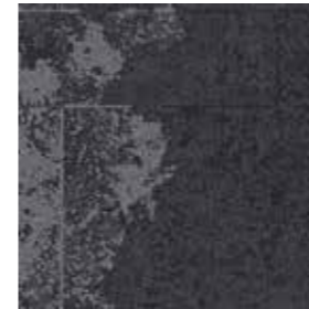
7416001 BLACK SEA