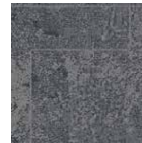
7414002 NORTH SEA