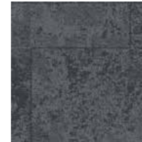
7418002 NORTH SEA