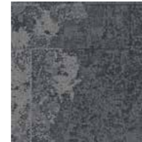
7416002 NORTH SEA