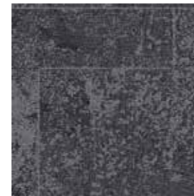
7414001 BLACK SEA