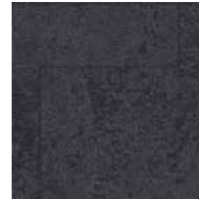
7418001 BLACK SEA